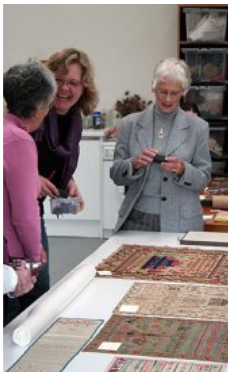
These pictures come from our first training day on the conservation of samplers.

we know some of you – previously successful in Challenge Fund applications – have not bought all the equipment you've received funding for. We're happy to readvise on upgraded specifications should the original specification be unavailable.