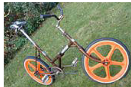
My first Dawes Kingpin... Full of new and advanced features. Still needs a wicker basket though.

shabby itself it's just Cinelera seems much more familiar to me and has a number of useful, more advanced features.